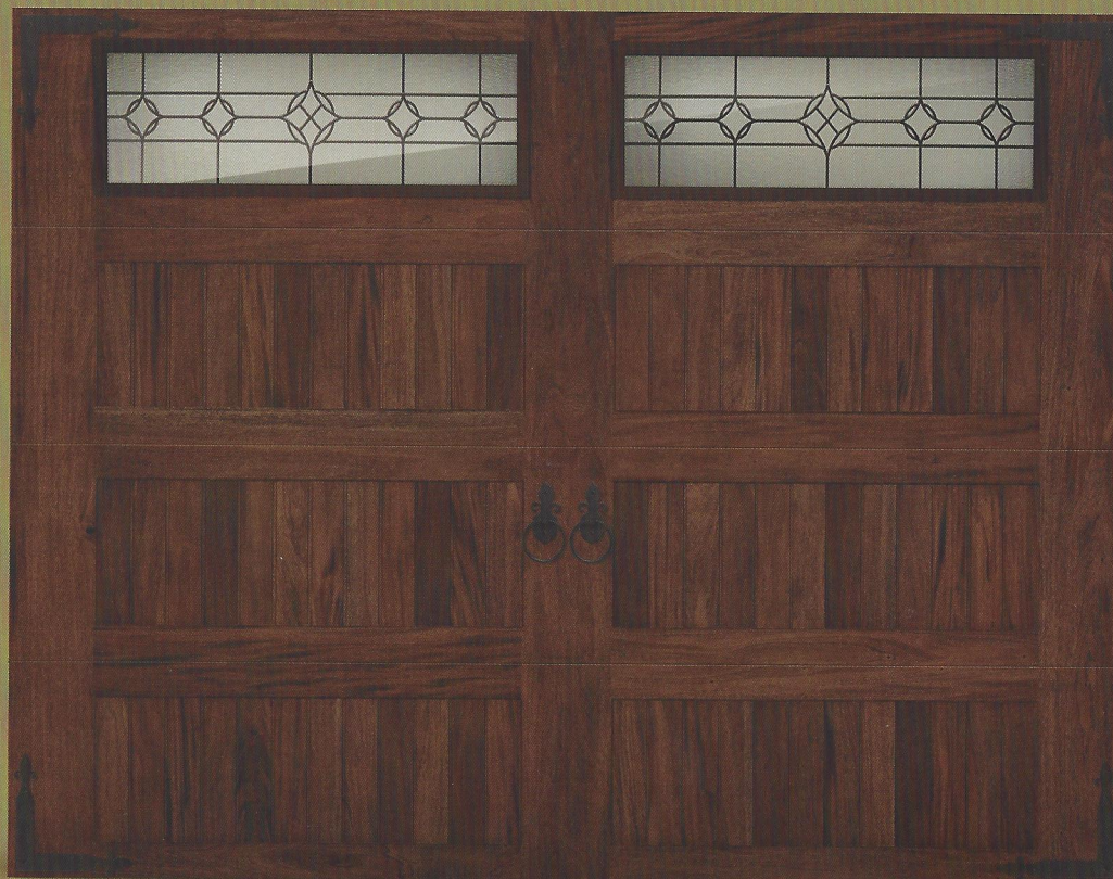
9' x 7' 5916 in optional mahogany accents woodtones with newport lites and barcelona 2 hardware